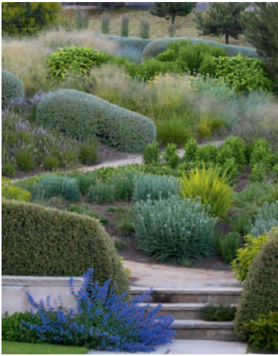
ABOVE Grasses mingle with perennials and clipped shrubs as the formal gardens slowly give way to wilder planting at the garden's margins. OPPOSITE Steps lead up through shrubs such as aromatic Euphorbia mellifera to the slopes above, pictured on the opening pages of this feature.