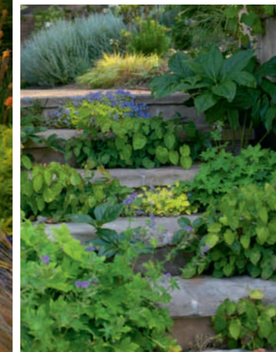
BELOW Crevices in the steps host plants such as Epimedium x versicolor 'Sulphureum', with heart-shaped leaves and yellow flowers in spring.