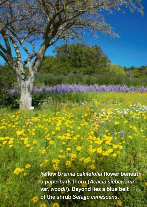
Yellow Ursinia cakilefolia flower beneath a paperbark thorn ( Acacia sieberiana var. woodii ). Beyond lies a blue belt of the shrub Selago canescens .